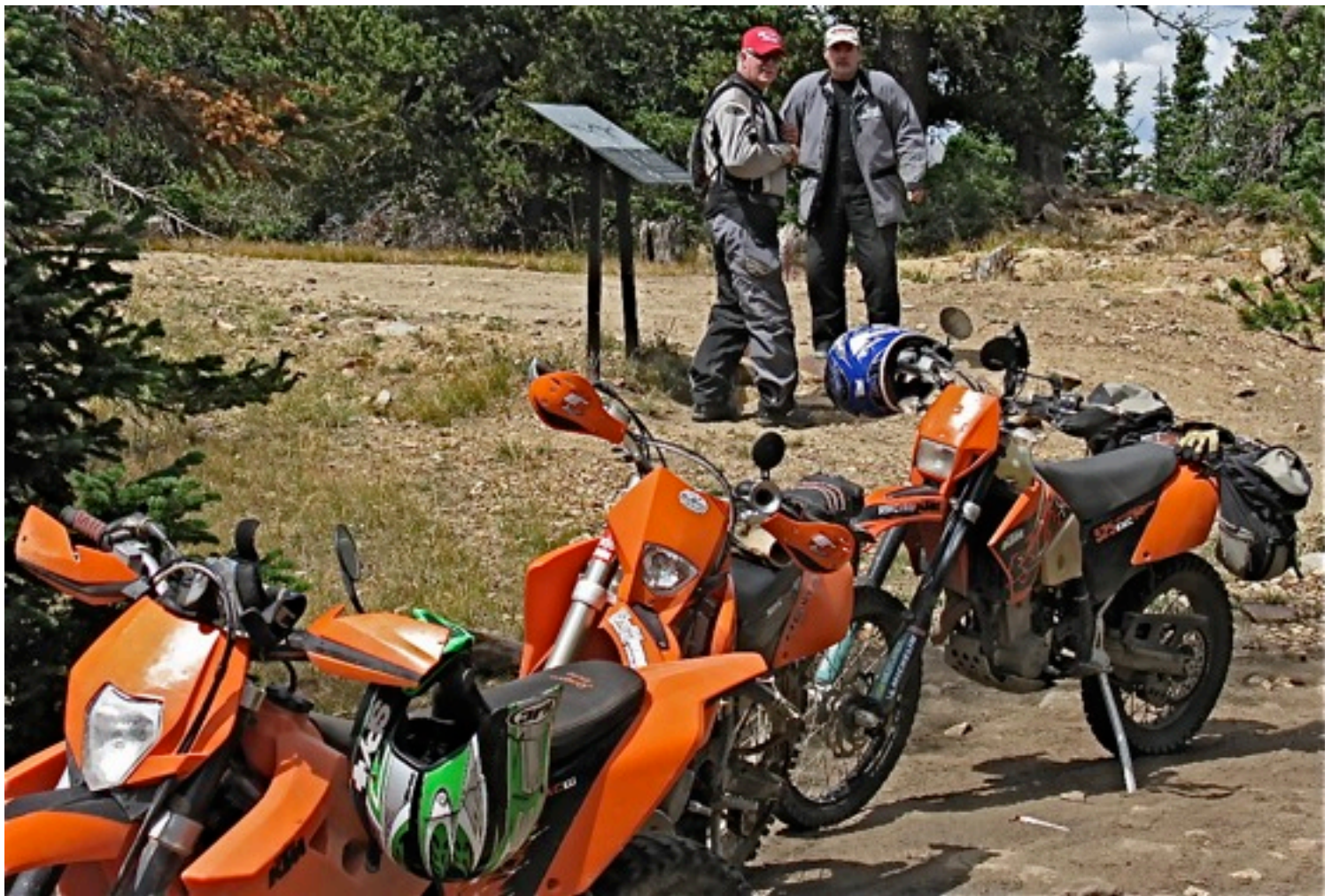
Tom's neato horn...