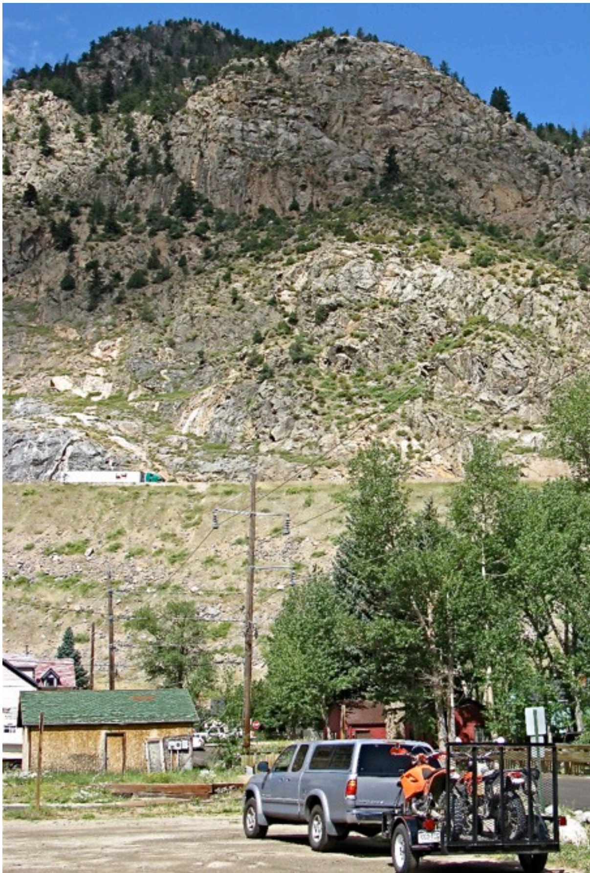
Below, more Georgetown...