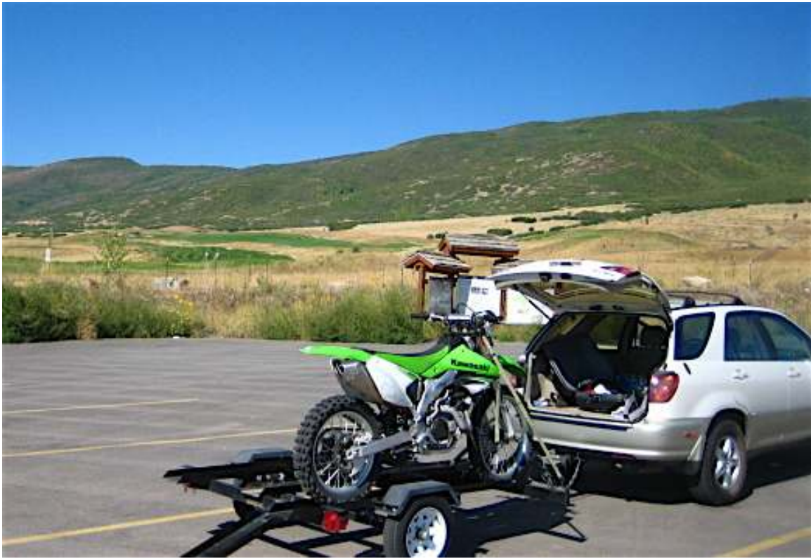
Off I go... Up! Up! Up!