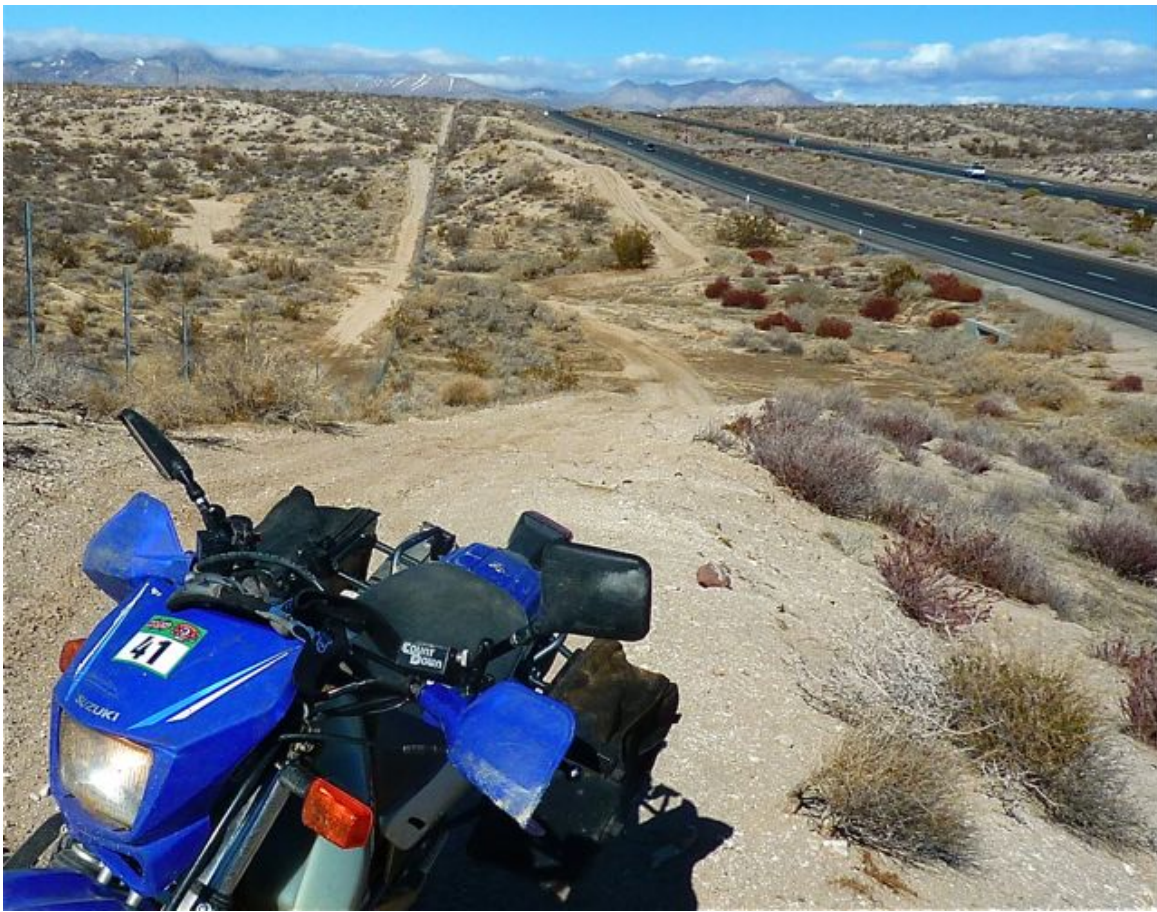
...through Dove Springs...