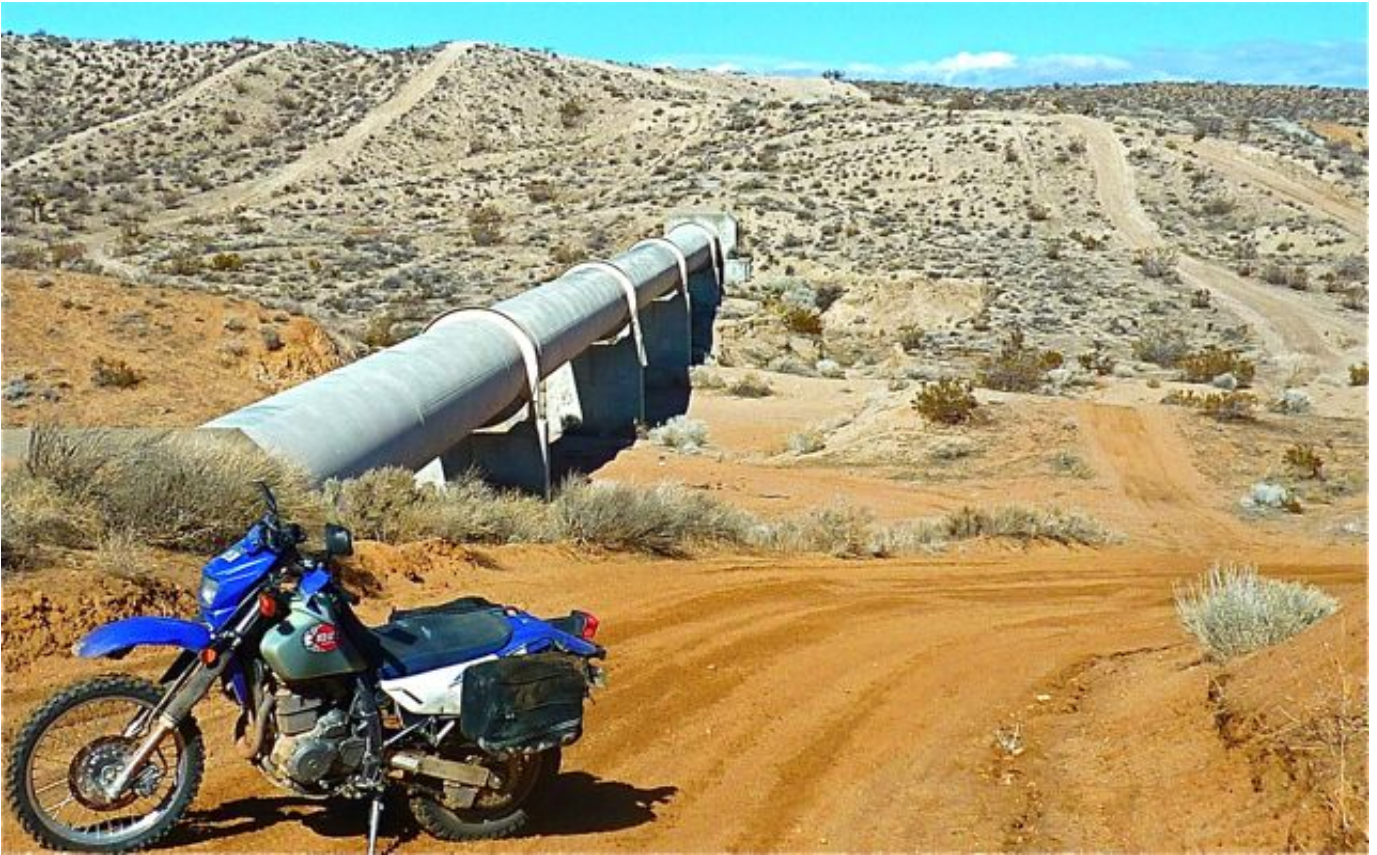
...following L.A. 2 (upper aqueduct road). Below, cresting Death Canyon...