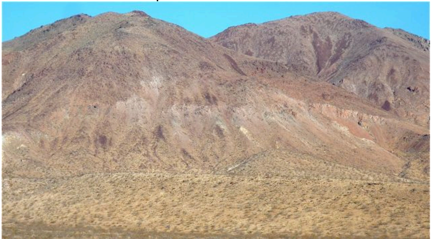
Below: On the way home, I rode up to the base of the saddle...