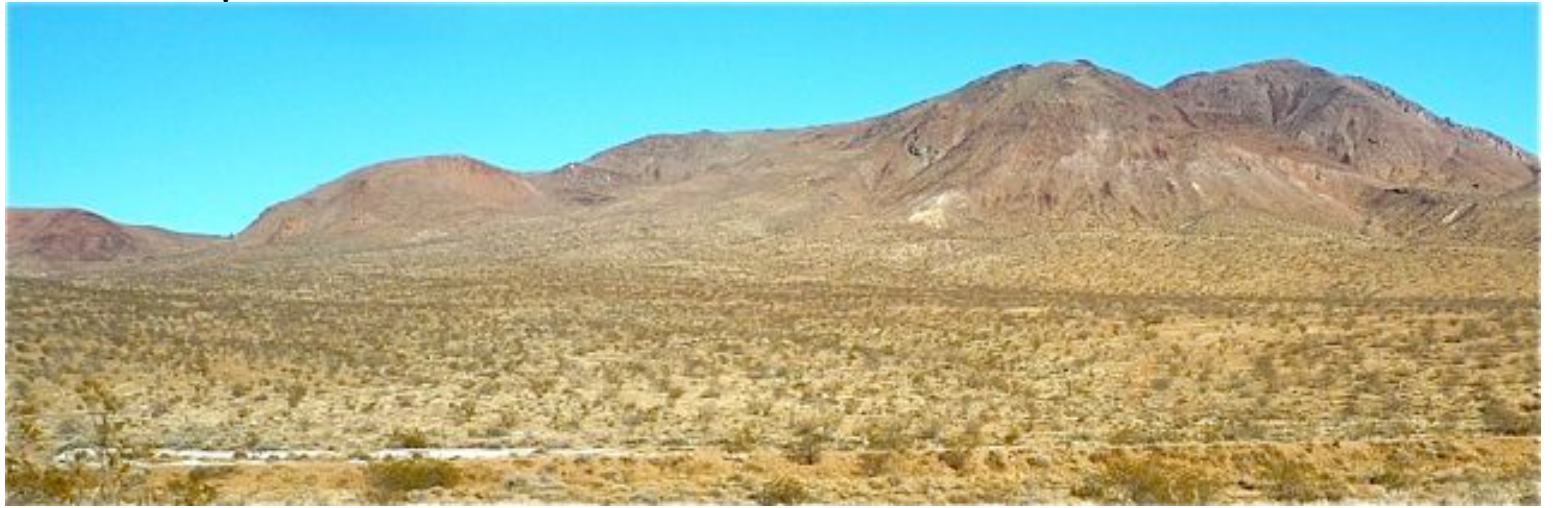
Below: I'd assault the peaks from the back-side...