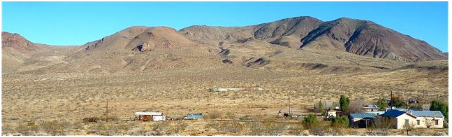
The twin-peaks of Red Mountain come into view...