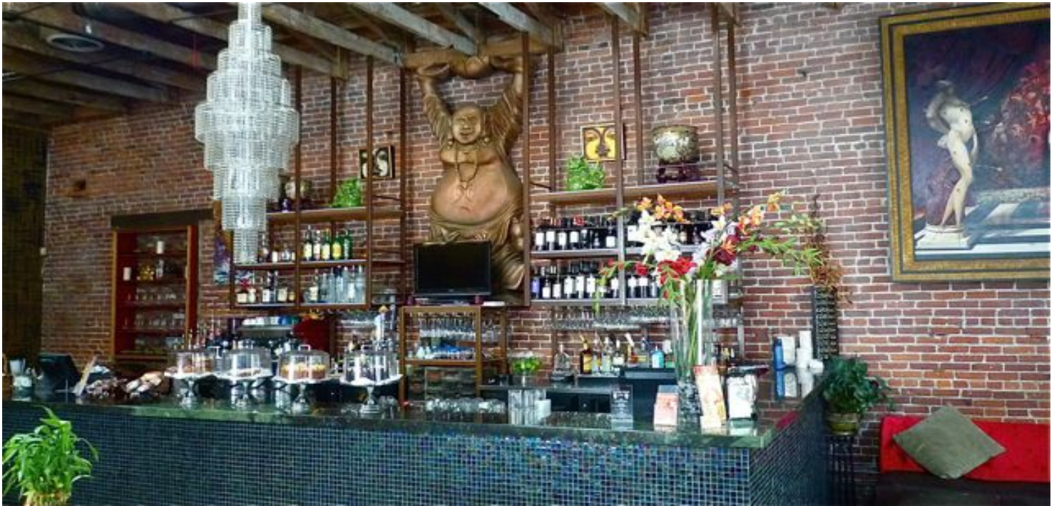
Below: I must say Potty-Land made a superb pic...