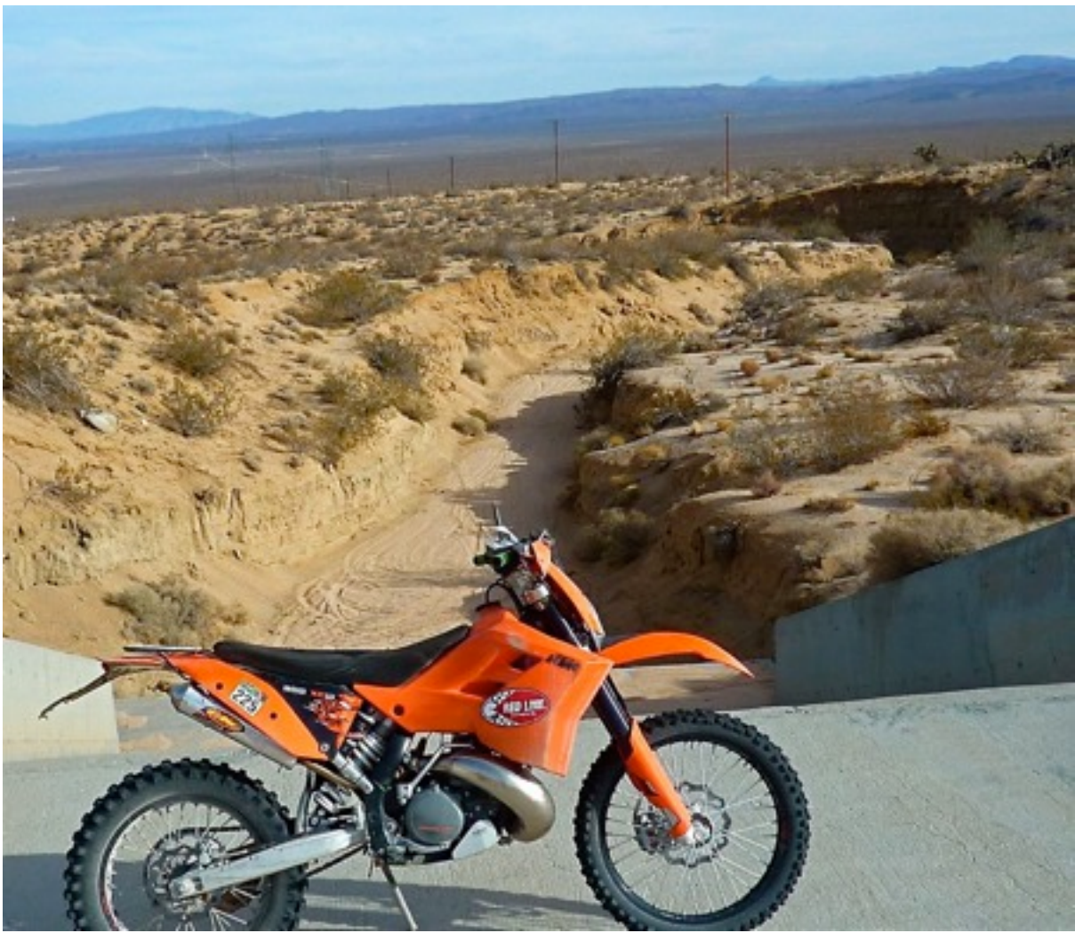
...past Robbers Roost...