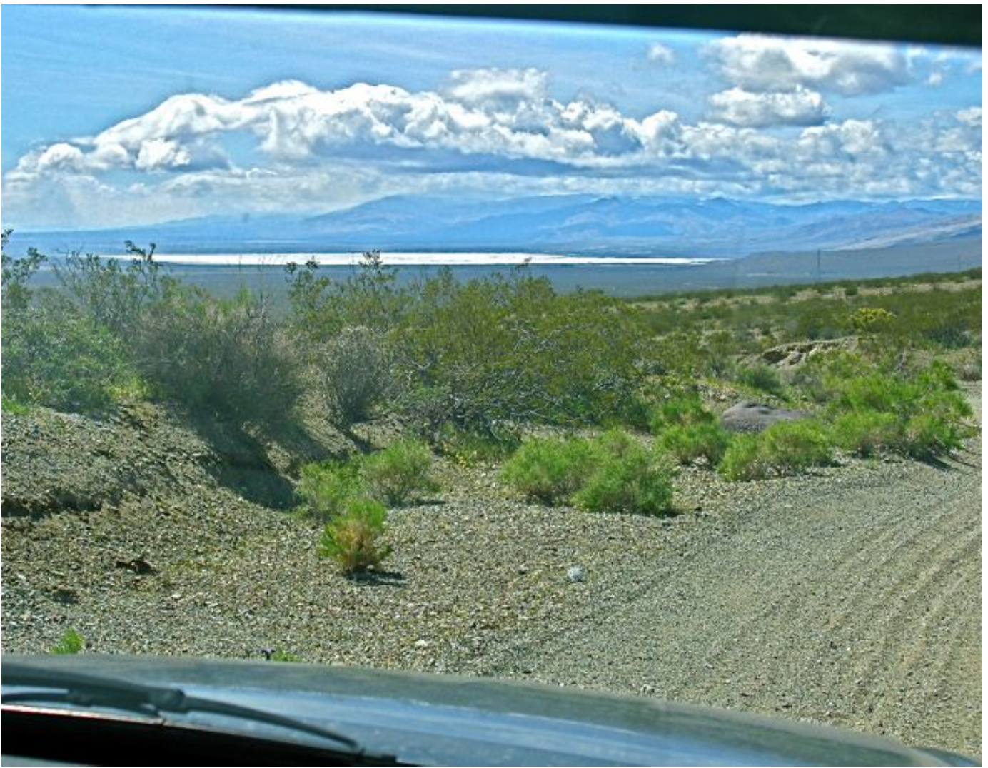
The above dry lake is 8 miles away, just before Jawbone OHV area... We made it! The Randsburg soda-fountain & store...