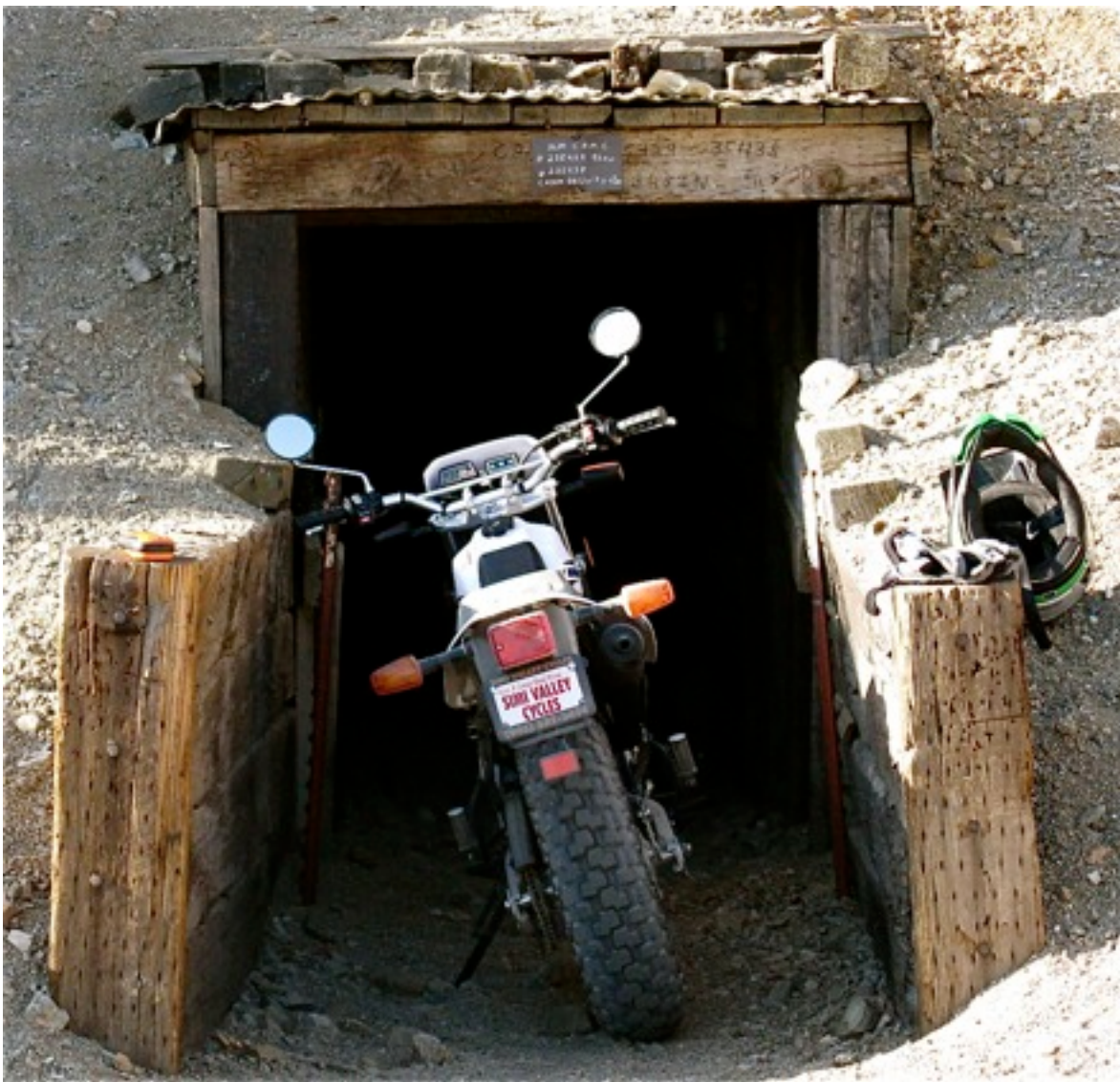
The wide-angle view...