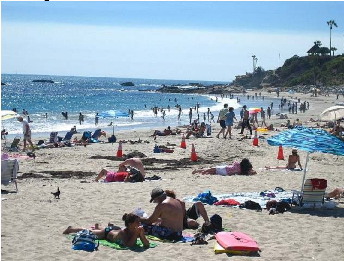
Looking south along the boardwalk...