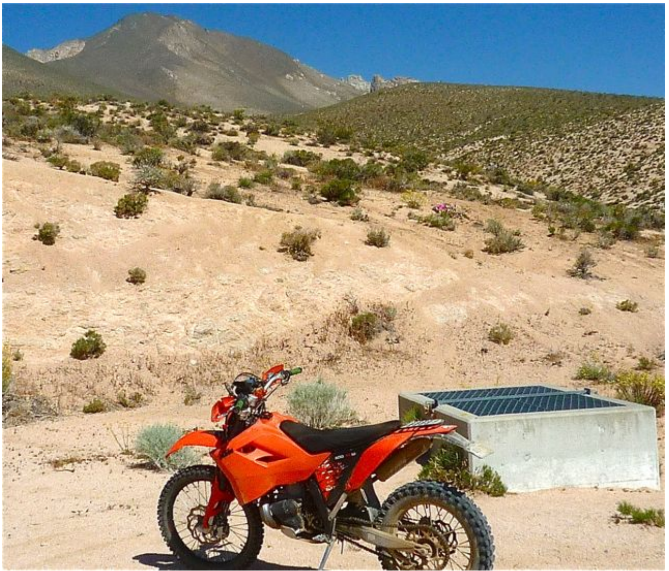
Whoa! The California Aqueduct flows below...