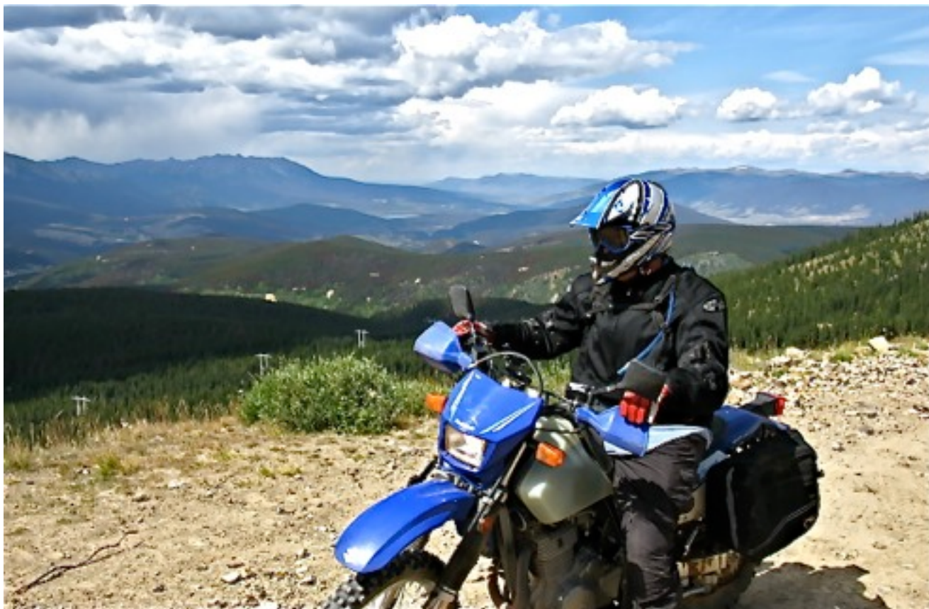
Breckenridge ski area across the valley (Art & Pigpen)...