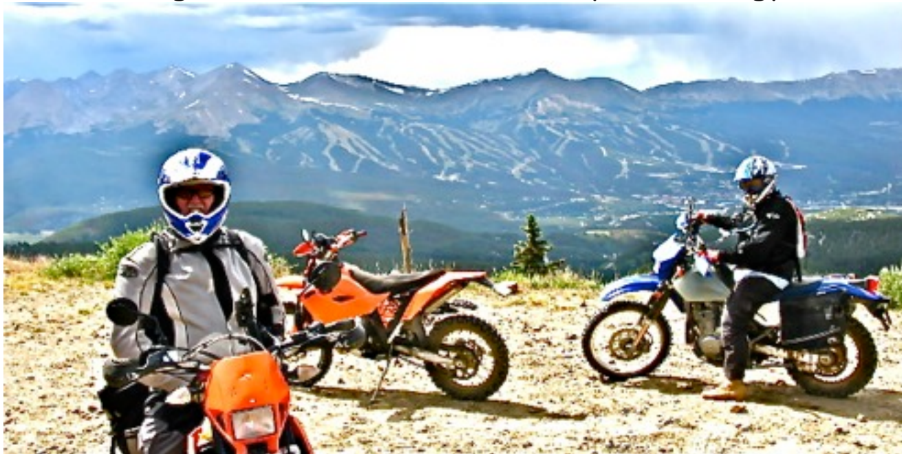
Breckenridge (town) is at 9,600'. Wow. The commercial radio station in the below pic at 13,000'+. All the bikes are running well, although Art's KTM is overheating on long climbs...